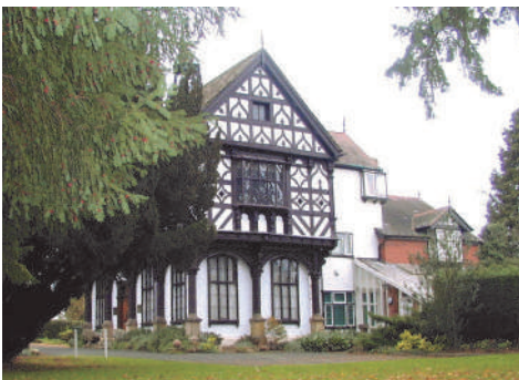
Grange Court 2000