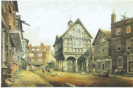
Grange Court Circa 1800