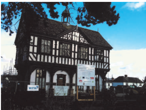
Work starts 2010