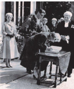
The Queen signing the guest book at Grange Court 1957