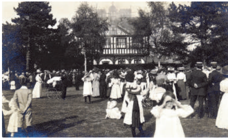
Grange Court great fire May 1909